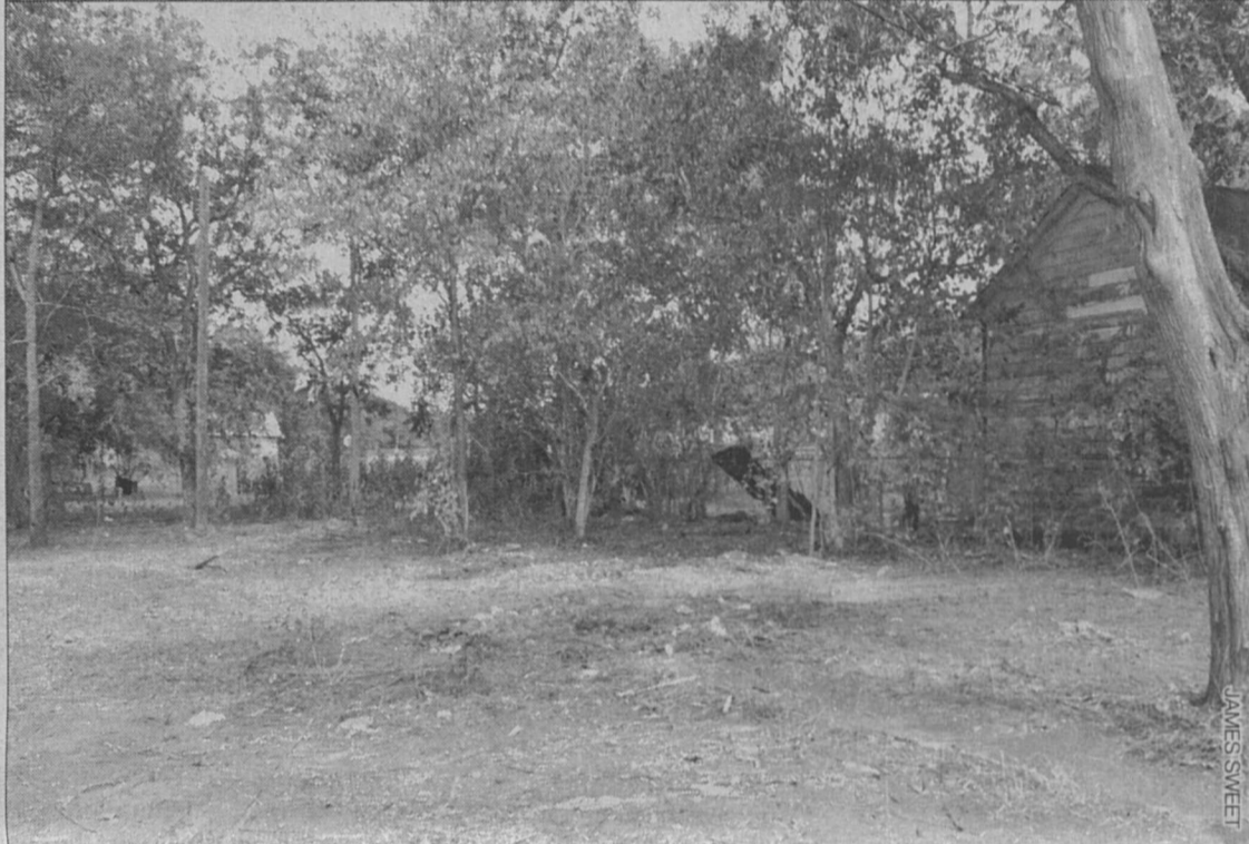
Top: The property at 816 East "C" Street before demolition by the city. Bottom: The same property after demolition is complete and the debris cleared.